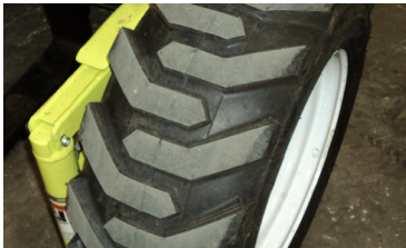
Skid Steer Tire

The spacious operator's compartment and centered driver's position provide superb visibility and comfort. Picture window visibility improves productivity and minimizes product damage.