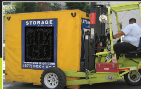
Container Handling Configuration

Donkey Forklifts have a low operating weight and a dependable mounting system. They are suitable for single axle trucks. It dismounts and is at work in under 30 seconds. Smart backup alarms, strobe lights, a salt corrosion package, safety training manual and safety video are all standard features when you purchase a Donkey Forklift.