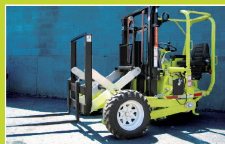
Low Profile Configuration