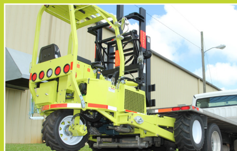
Single Axle Truck Configuration